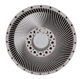
Impeller IN718 φ 380 x 156 mm